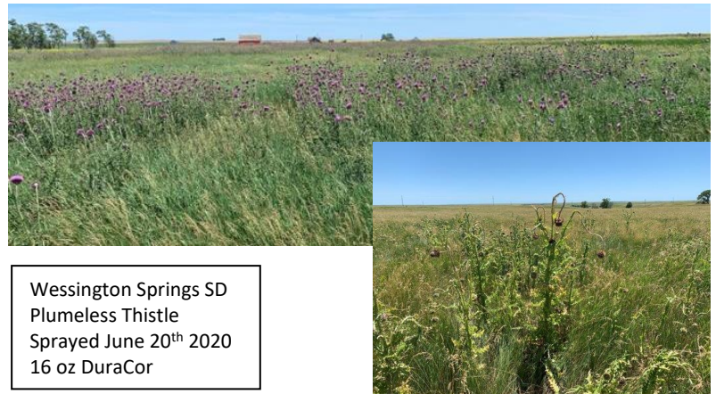
Wessington Springs SD Plumeless Thistle Sprayed June 20 th 2020 16 oz DuraCor

In the Dakota's alone TerraVue and DuraCor have been sprayed on over 140,000 acres. As a reminder both products contain Milestone and the new active ingredient Rinskor which broadens the weeds controlled to 140 weeds verses 70 labeled weeds on the Milestone label. Rinskor is a new active ingredient that targets a new site of action on the plant achieving better contact on all species but particularly on wild carrot and wild parsnip species. Same if not better control has been achieved on North Dakota Noxious Weeds including Absinth wormwood, Canada thistle, Diffuse/Russian/Spotted Knapweed, Musk thistle, Palmer amaranth, Purple Loosestrife, and more! Brush control results are promising on Russian Olives when combined with Vastlan.