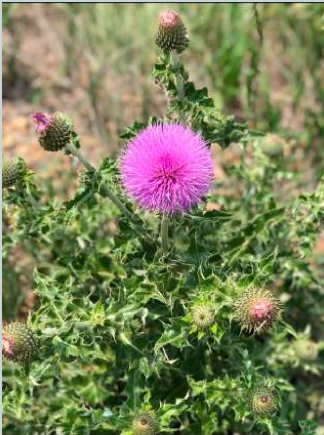
Early Blooming Musk Thistle